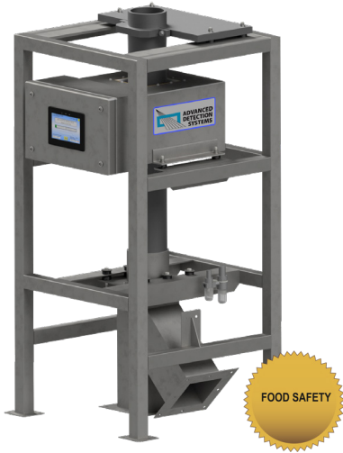
ProScan Gravity Drop System