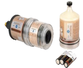
Tech Lube Kits/Refills