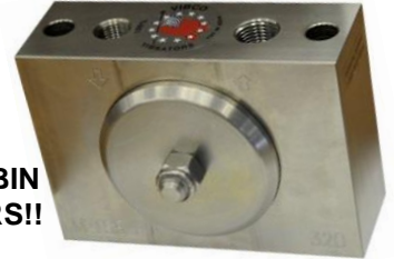
Stainless Steel Silent Turbines