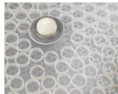
Self Cleaning Kits