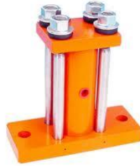
Pistons & Impactors