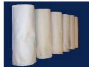
In Stock Dust/Filter Socks 3-8" ID