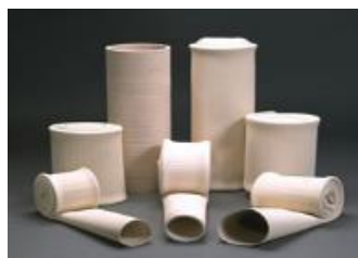
GUM RUBBER TUBING 3/8" TO 26" Dia.