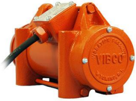
Heavy Duty Electrics