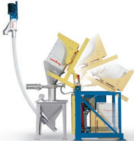
TIP-TITE® Universal Drum Dumper handles drums from 30 to 55 gal (114 to 208 liter)