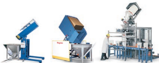
Also available (left to right): Open Chute Drum Dumpers, Open Chute Box/Container Dumpers and High Lift Drum Dump Filling Systems

Most importantly, all are engineered, manufactured, guaranteed and supported by Flexicon—your single-source solution for virtually any bulk handling problem.