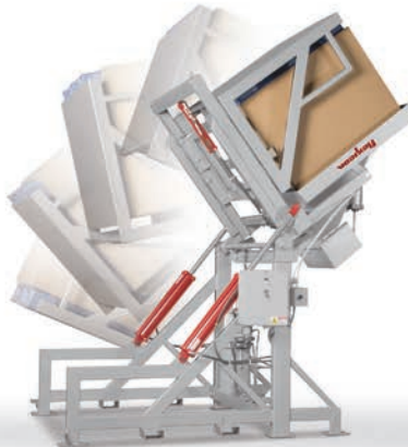
TIP-TITE® Box/Container Dumper handles boxes up to 48 in. W x 48 in. D x 44 in. H (1220 mm W x 1220 mm D x 1118 mm H)