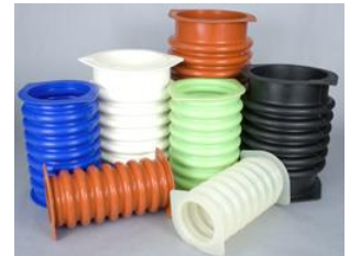
Rectangular Screens for all Brands Self Cleaning Kits Tech Lube Kits/Refills Belled Connector Boots