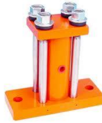
Pistons & Impactors