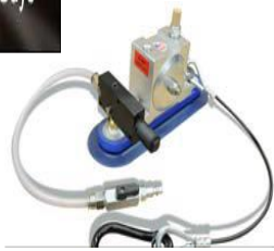
Easy to move Stik-It Mount