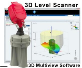
3D Multiview Software