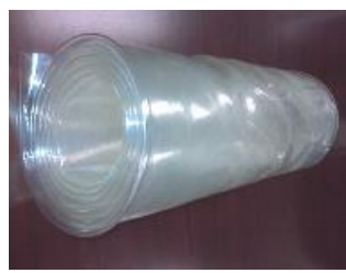
CLEAR POLY TUBING