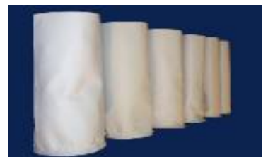
In Stock Dust/Filter Socks 3" to 8" ID