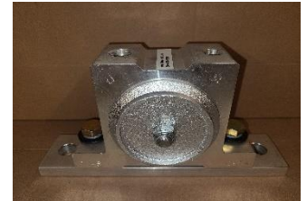
PLAS-320A Silent Turbine