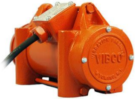
Heavy Duty Electrics