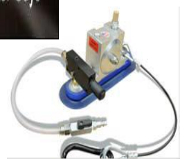
Easy to move Stik-It Mount