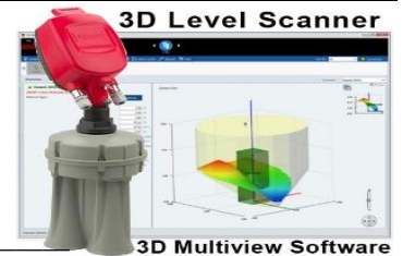
3D Multiview Software