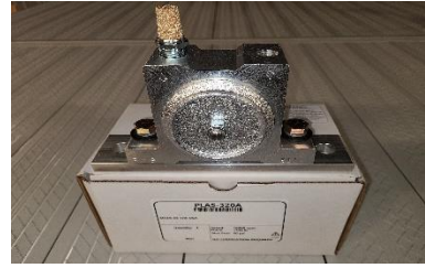
PLAS-320A Silent Turbine