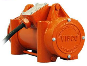
Heavy Duty Electrics