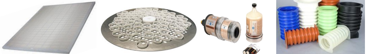
Rectangular Screens for all Screeners Self Cleaning Kits Tech Lube Kits/Refills Bellowed Connector Boots