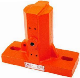
Pistons & Impactors